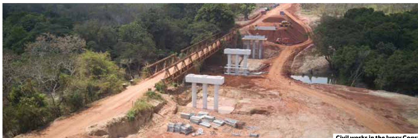
Civil works in the Ivory Coast