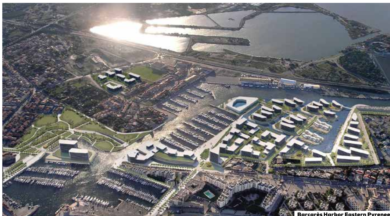
Barcarès Harbor Eastern Pyrenees