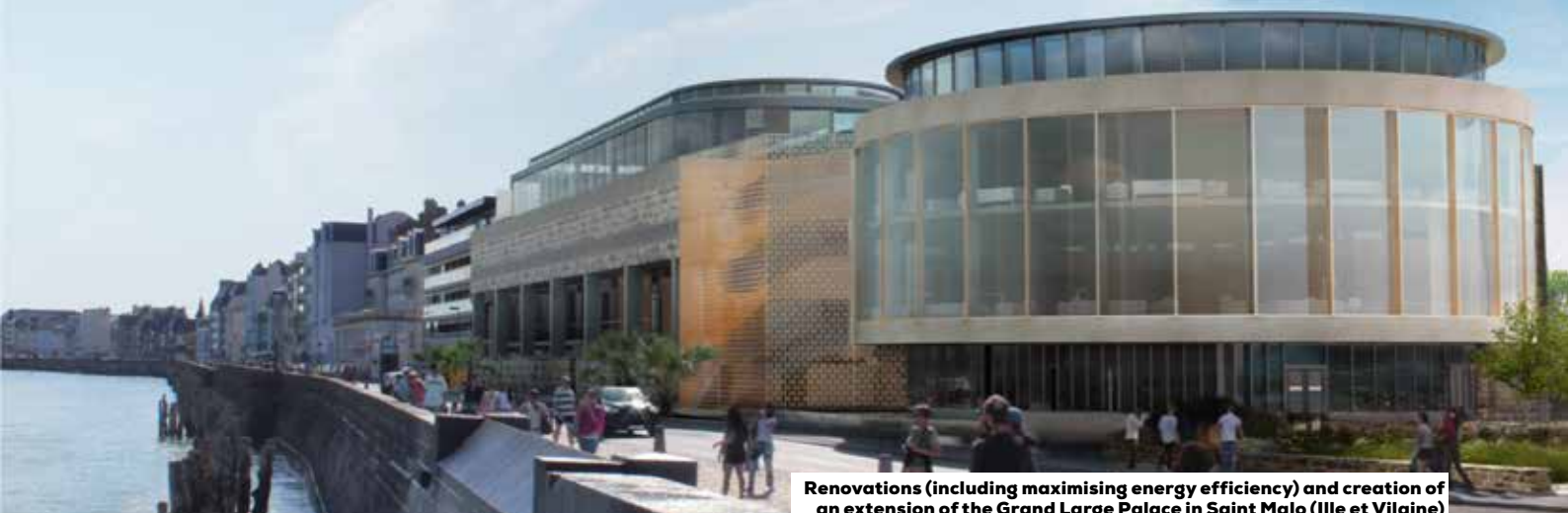
Renovations (including maximising energy efficiency) and creation of an extension of the Grand Large Palace in Saint Malo (Ille et Vilaine)