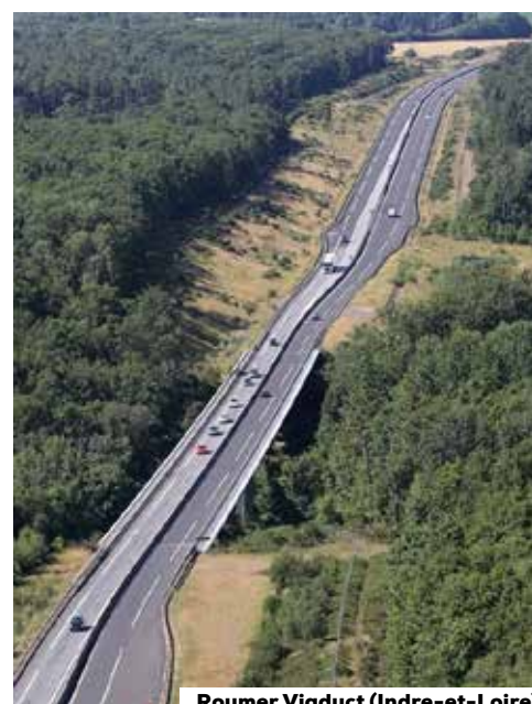
Roumer Viaduct (Indre-et-Loire)