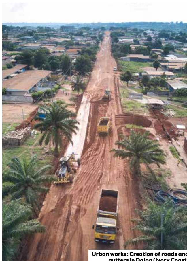
Urban works: Creation of roads and gutters in Daloa (Ivory Coast)

Impairment losses are recorded in profit and loss and the corresponding associates' carrying amount is decreased.