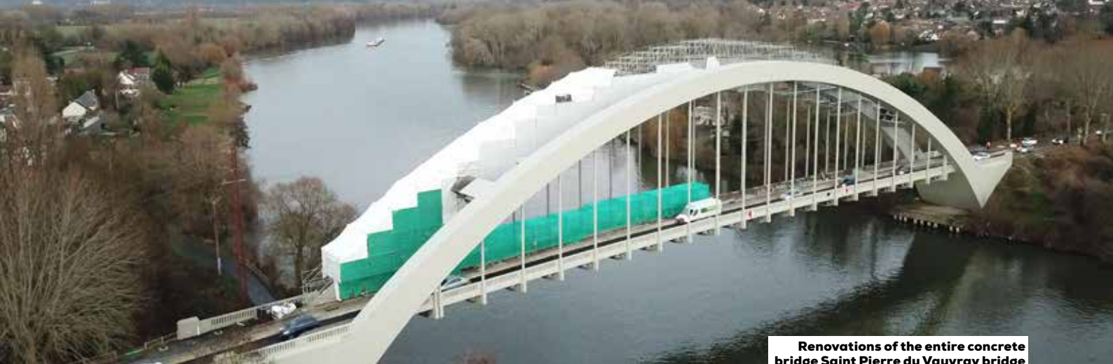
Renovations of the entire concrete bridge Saint Pierre du Vauvray bridge