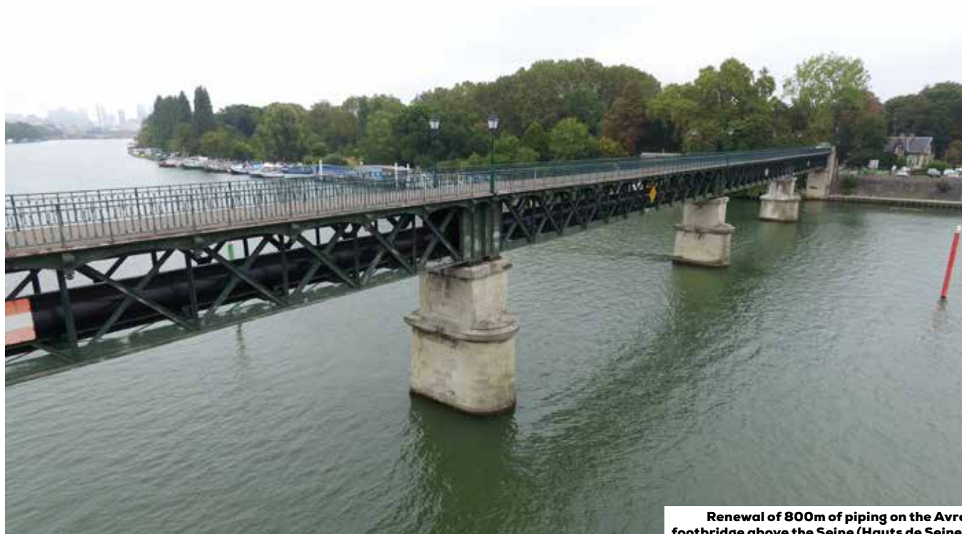
Renewal of 800m of piping on the Avre footbridge above the Seine (Hauts de Seine)