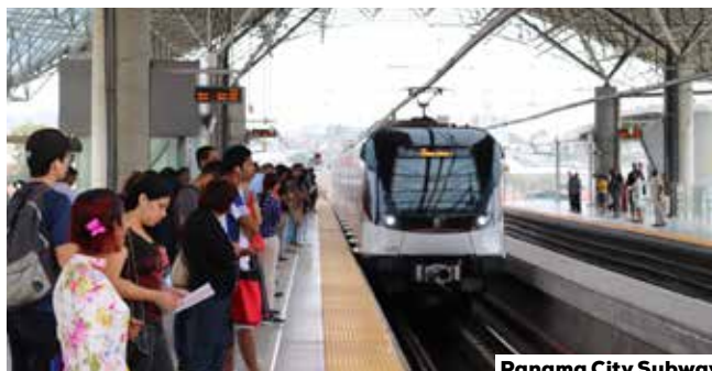
Panama City Subway