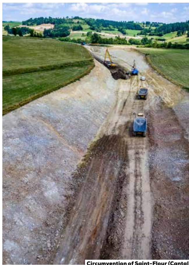
Circumvention of Saint-Flour (Cantal)