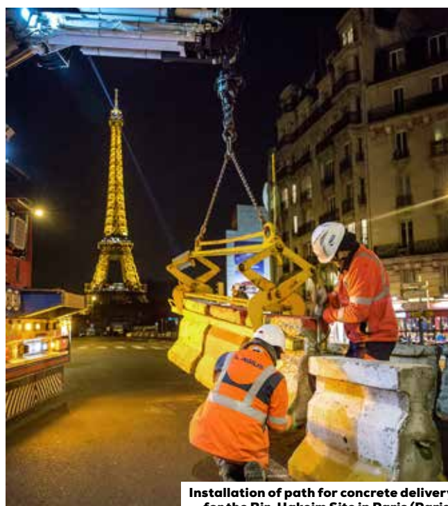
Installation of path for concrete delivery for the Bir-Hakeim Site in Paris (Paris)

Current provisions are provisions directly linked to the normal operations cycle for the less than one-year share.